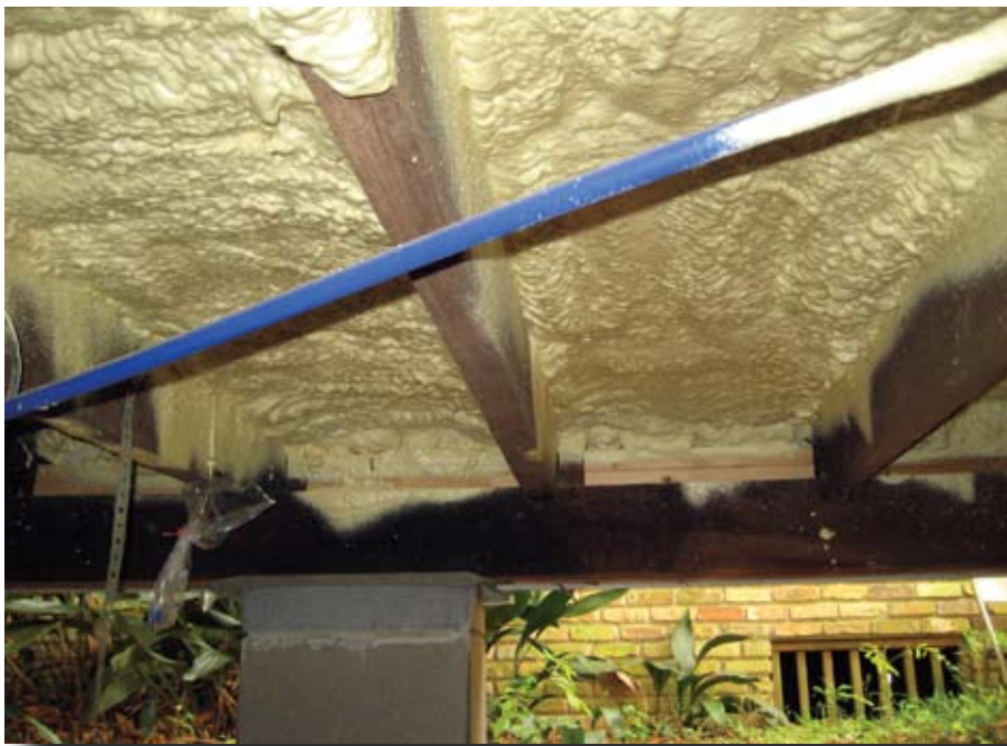
Figure 4b. Example of closed cell spray foam.

The sample of 12 houses included six different insulation systems: