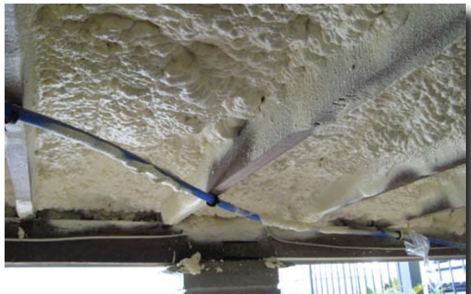
Figure 4c. Example of open cell spray foam.