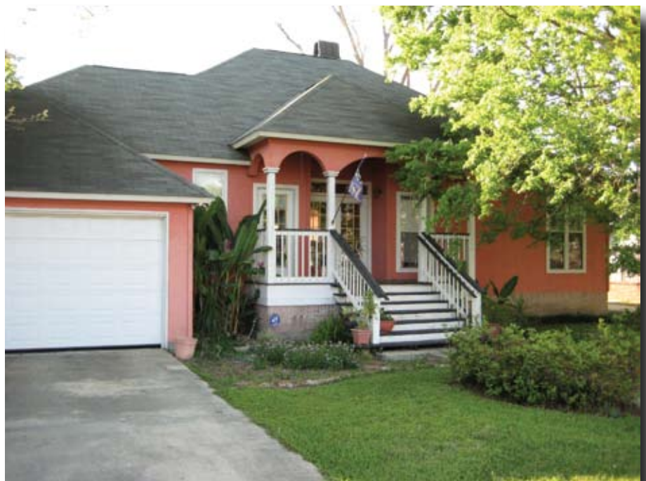
Raised floor home in Baton Rouge

In contrast, if the floor finish was vinyl, the vapor retardant paint applied over open cell foam appeared to result in lower subfloor moisture contents on average (relative to an otherwise identical floor system with the vapor retardant paint omitted), but some individual moisture readings still exceeded 16 percent moisture content. The data regarding the effect of vapor retardant paint were not conclusive, and further research is needed to determine whether the combination of open cell foam and vapor retardant paint can be a reliable strategy for preventing summertime moisture accumulation in subfloors in this climate.