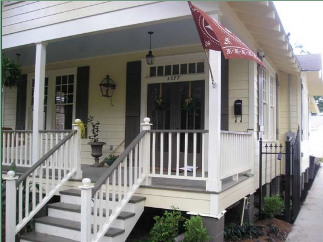
Raised floor home in Baton Rouge

Research Findings on Moisture Management