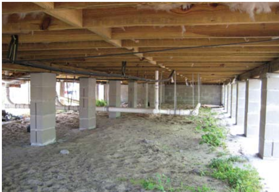
Figure 1. Example of an open crawlspace.

The rates of wetting and drying of building assemblies, whether they are floors, walls or ceilings, can be affected by thermal insulation. The job of thermal insulation is to slow down heat flow – to help keep the inside of the house warm when it's cold outside and cool when it's hot outside. In addition to its thermal resistance, insulation provides some resistance to moisture migration, and this resistance can vary widely between different types of insulation. Insulation's effect on limiting heat flow will coincidentally make certain parts of the floor assembly warmer (or cooler) than other parts of the assembly. This is important because wood tends to dry when it is warm relative to its surroundings and is prone to moisture accumulation when it is cooler than its surroundings.