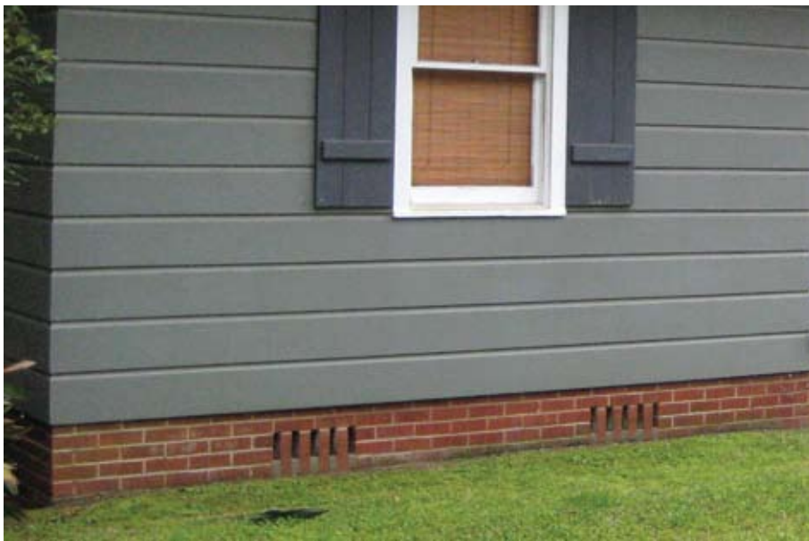
Figure 2. Example of a wall-vented crawl space.

of construction is not typical and is risky in flood hazard areas.