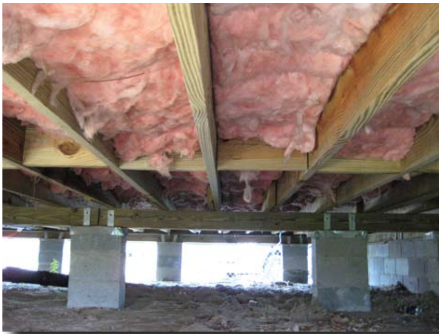
Figure 4d. Example of typical fiberglass batt insulation.