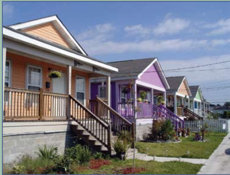
Raised floor homes in New Orleans