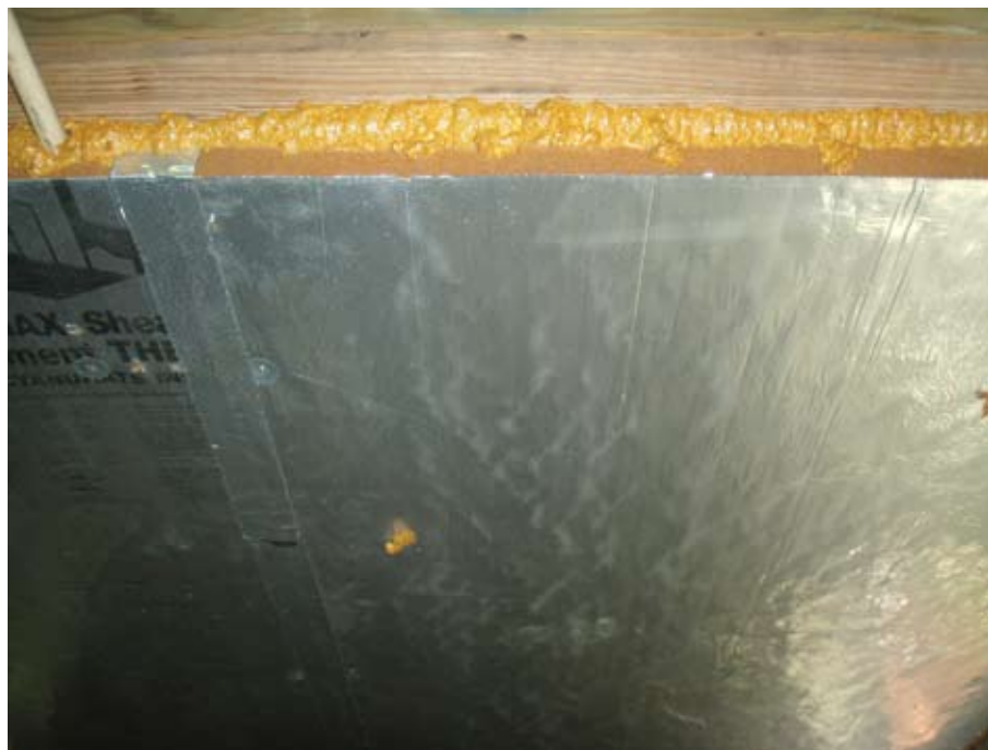
Figure 4a. Example of rigid, foil-faced polyisocyanurate foam.

Air temperature and humidity were measured with data loggers placed indoors, outdoors and in crawl spaces. Moisture content and temperature of the wood or plywood subfloor was measured, typically twice each month. Monitoring started in October 2008 and concluded in October 2009.