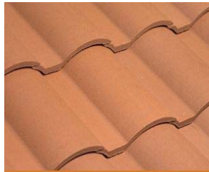
Concrete "S" Tile