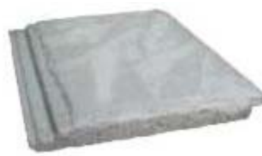
Concrete Flat "slate" Tile