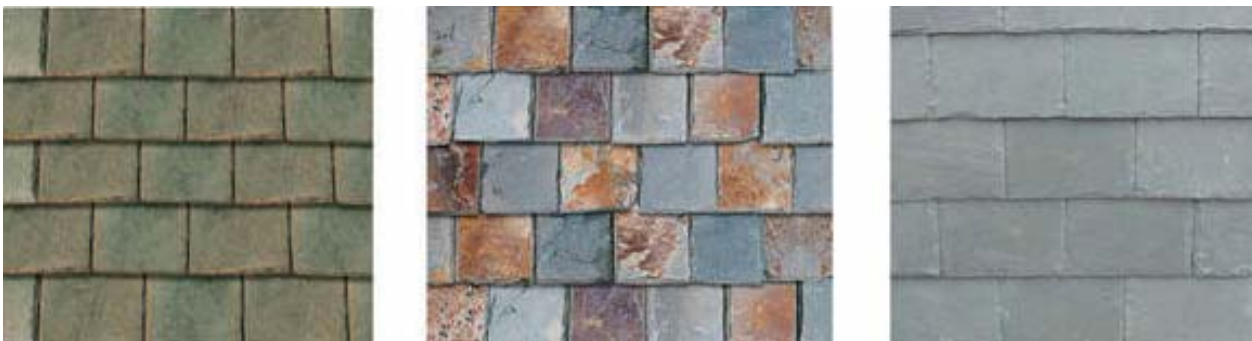
Figure 10-3 Natural Slate Tiles

Traditionally slate roofing tiles were hand cut and sized, but now manufacturers pre-cut the slate roofing tile with a machine to assure exact measurements. Nail holes are also pre-drilled and countersunk to speed construction and repair. Countersunk holes allow the roof tile to lie flat for longest possible lifetime. A stronger roof structure is needed to withstand the weight of slate roofing material; therefore many manufacturers require an architect's recommendation on each property prior to installation of natural slate roofs. There are other alternatives to natural slate which are considered below.