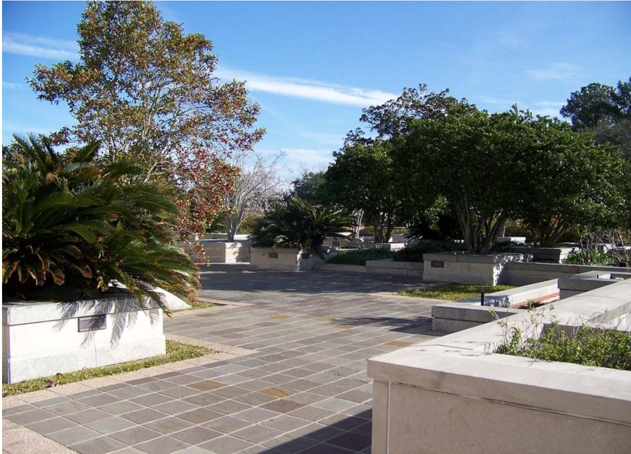
Figure 10-6 Landscaped “Green Roof”

This landscaped roof is over the east addition to the Louisiana State Capitol. The subterranean space below grade functions as the House of Representative’s Committee Rooms. A similar addition on the west side is over the Senate Committee Rooms. The difficulty of aesthetically matching this 1937 high rise historical structure with flanking additions played a role in making the additions below grade. The energy savings and creation of public spaces were also a benefit.