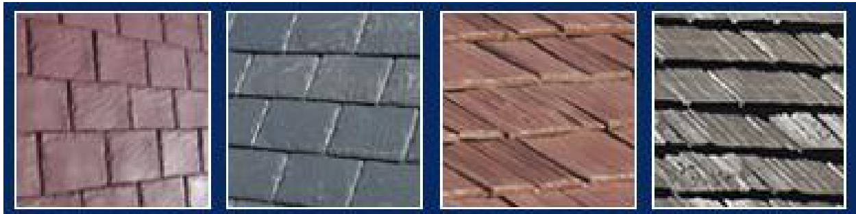
Figure 10-5 Rubber Shingles

These shingles are made from recycled automobile tires and can simulate the look of slate or wood shakes with relatively low weight. They are obviously hail resistant.